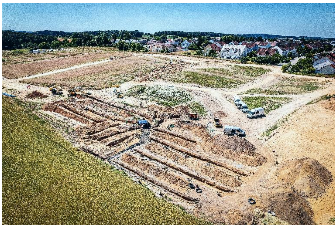
(1) New “Kellerbergbreite” housing development in Schrobenhausen: Bauer Resources constructed a geothermal probe system and cold district heating network for a total of 64 residential buildings.