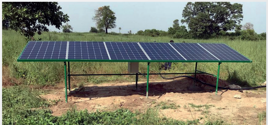
Senegal: Water supply in rural areas