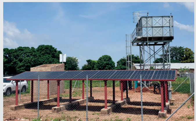
Gambia: Water supply for small communities/operations