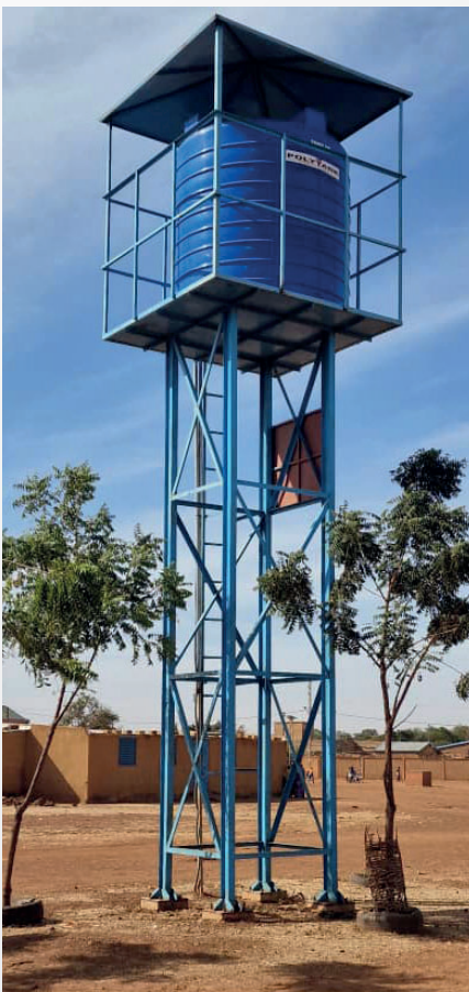
Burkina Faso: Water supply in rural areas