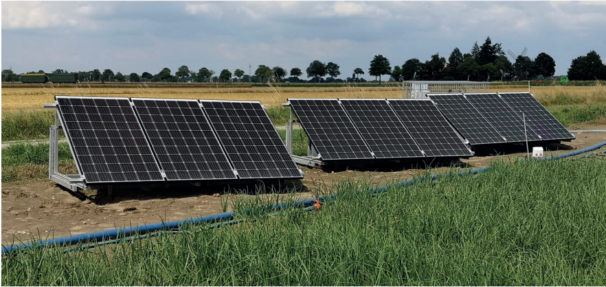
Germany: Agricultural irrigation